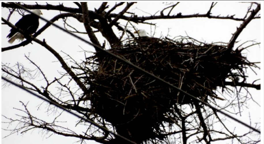
Eagle in nest and one standing guard