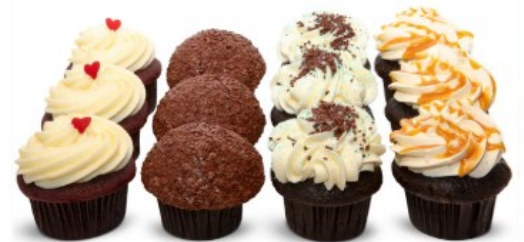
pictured is a Favorite Selection from Trophy Cupcakes